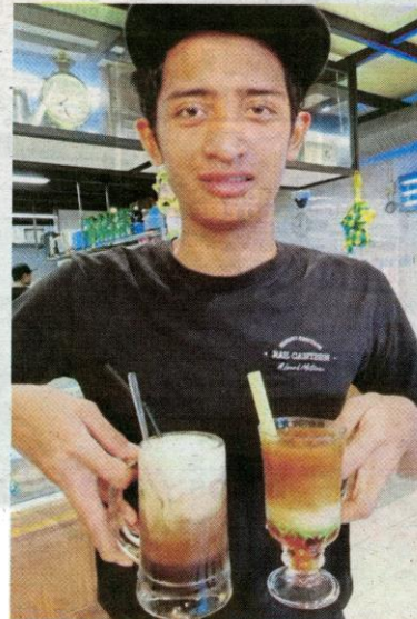
A waiter holds up drinks, which require the use of straws. Vendors hope the government will help them find a more economical alternative soon.

She added that they were open to the idea of paper straws but such straws cost more, while providing metal straws may seem like a better option but people may question the hygienic aspect of it.