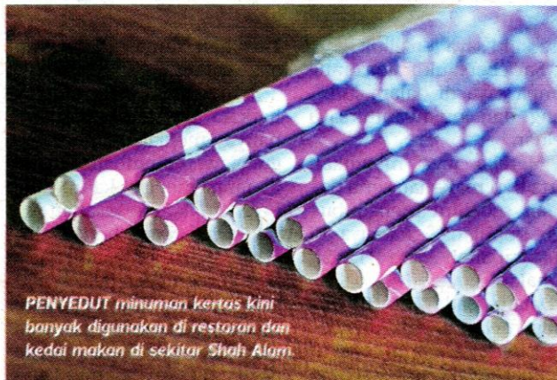
PENYEDUT minuman kertas kini banyak digunakan di restoran dan kedai makan di sekitar Shah Alam.