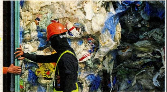
Not needed here: Containers filled with plastic waste being displayed at Port Klang, Selangor. Canada is one of the countries that shipped its waste to Malaysia.

Late last month, AFP reported that tonnes of garbage sent to the Philippines years ago were shipped back to Canada after a festering diplomatic row.