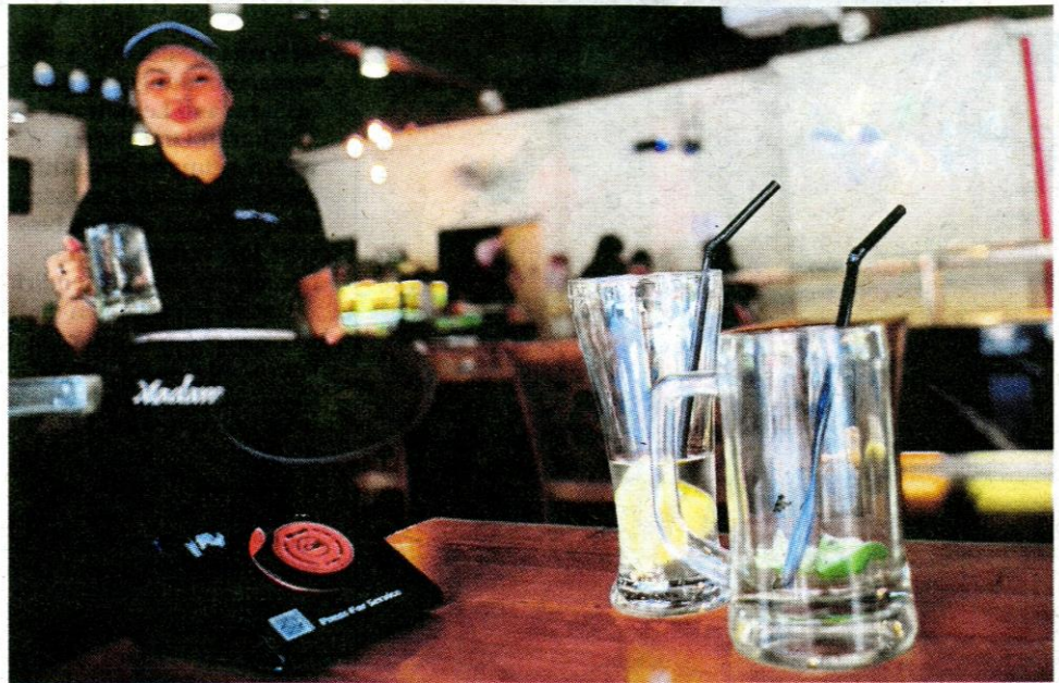
BEBERAPA premis memberikan penyedut minuman atas permintaan pelanggan.

Loy Sian berkata, premis juga dilarang menyediakan penyedut plastik di kaunter untuk diambil secara bebas dan pelanggan hanya boleh memintanya sekiranya memerlukan.