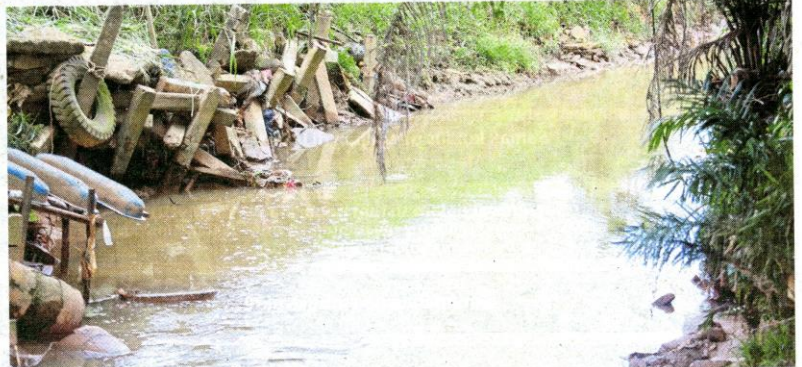
Kedadaan Sungai Kim Kim selepas kerja pembersihan dilakukan.

"Selepas operasi pembersihan sungai berkenaan selesai beberapa bulan lalu, penduduk tidak diberi