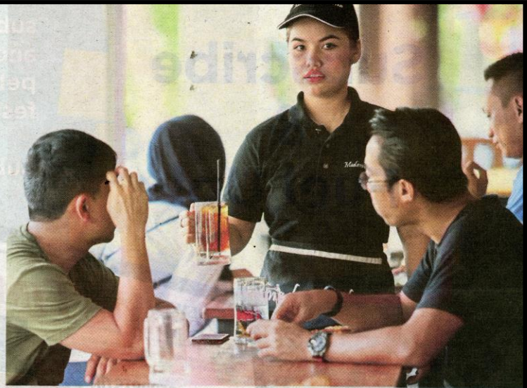
Restaurant operators hope customers will help them adhere to the Selangor government's directive.

"A suitable and cost effective alternative is needed as a long term solution to ensure that our